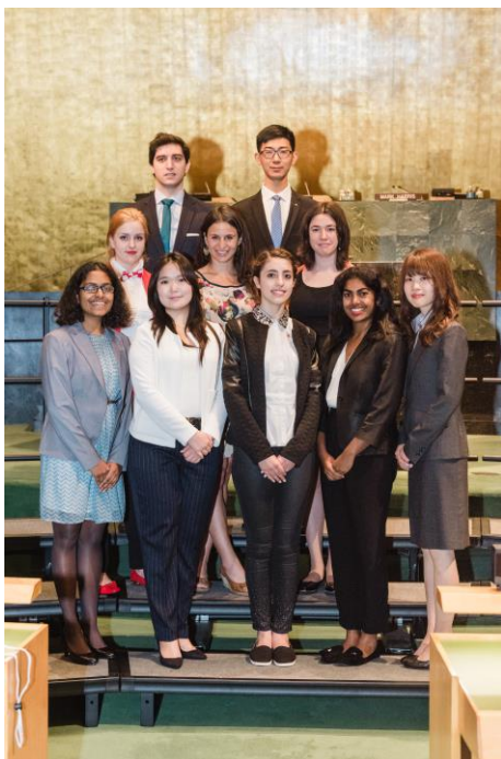
Winners of the Many Languages, One World contest who came from UNAI Member Universities.

Being multilingual has obvious practical benefits in an increasingly globalized world. However, the advantages of multilingualism go beyond being able to converse with a wider range of people. Learning another language contributes to creativity and complex thinking, promotes tolerance and intercultural understanding and allows one to understand the world in different ways.